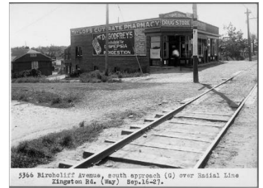
5366 Birchcliff Avenue, south approach (G) over Radial Line Kingston Rd. (Way) Sep-16-27.

Scarborough was a predominantly rural area until well into the 20 th Century. Birchcliff was the first area of the sprawling township to experience urban growth, a direct result of the area's proximity to the city of Toronto. By 1908, a radial line connected the area with Toronto and the township government was established in the neighbourhood. The municipal offices were situated just a block from the present church building, from 1922 to 1947. As evidence of its growth, it was in the Birchcliff neighbourhood that Scarborough's first Dominion supermarket and Canadian Tire stores were established. In