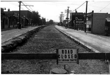
6247 Kingston Road, west from Birchmount. (Way). Sep-10/28.

Although we typically consider history as a chronological study of man's imprint on his surrounding landscape, in the context of a Christian perspective, we are inclined to appreciate the hand of our Lord as an instrument in fashioning that progression. As a consequence, the history of Scarborough Baptist Church is more correctly viewed as a divine evidence of Our Creator's desire to make His presence known within the southwest Scarborough community and beyond. In that regard, men and women serve as His earthly instruments.