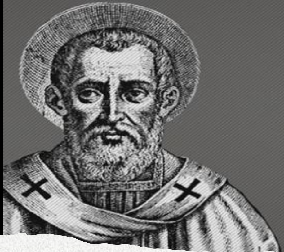
Martyrdom of Polycarp Bishop of Smyrna 155 AD